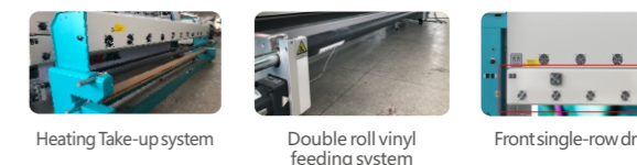
Heating Take-up system